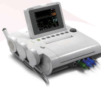
F3 Fetal Monitor