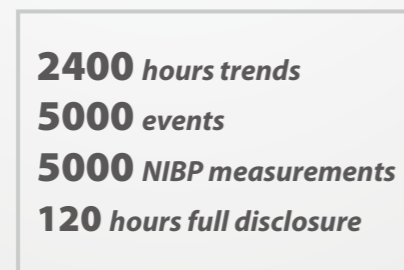
Huge data capacity