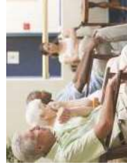
Medical Centers with basic facilities